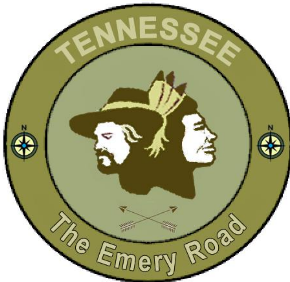
A patch calling attention to the Historic Emery Road