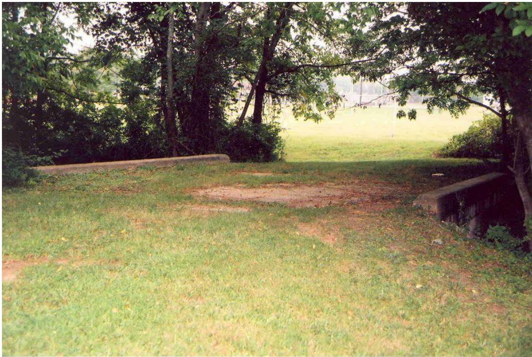
The Rock Pillar Bridge built just after 1900